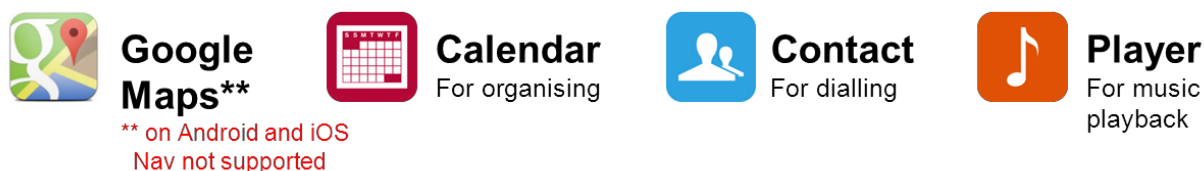
Fig. 2 – InControl™ Apps Launch Content

The smartphone will be connected via USB to the Audio Interface Panel which has been (relocated at 14MY to the upper glove box). On InControl™ Apps vehicles, a second dedicated USB connection is added to the panel.