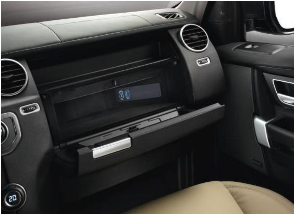
Fig. 3 – Audio Interface Panel in Glovebox (Aux-in, audio USB and InControl™ Apps connections where fitted)