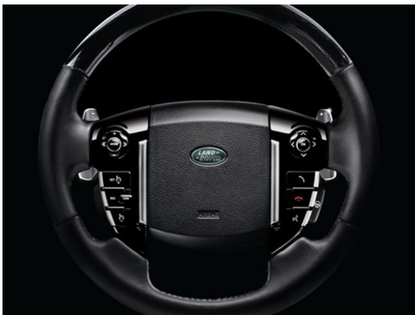
Fig. 4 – Grand Black Lacquer Wood/Leather Steering Wheel (032DR)

A wood/leather steering wheel first seen on the XXV LE will be available to order on 15MY vehicles fitted with Grand Black Lacquer (HSE / HSE Lux only).