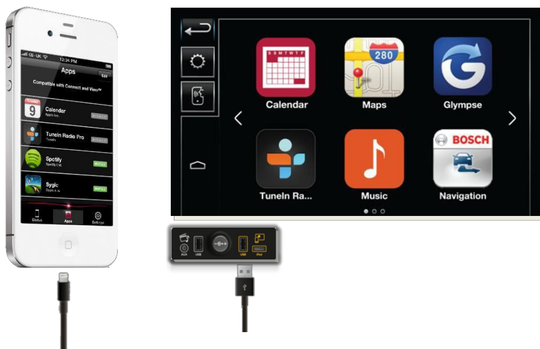
Fig. 1 – InControl™ Apps Architecture (025PA)

InControl™ Apps, the first introduction uses leading in-car mobile technology to connect smartphone apps to the car's infotainment system, supported initially from Apple iPhone 5 onwards and compatible Android devices (minimum v4.0 - not all devices will be officially supported). Key apps such as Contact, Maps, Calendar and the Music player work out of the box and a stream of locally approved apps will be released over time to ensure a constantly fresh and relevant user experience.